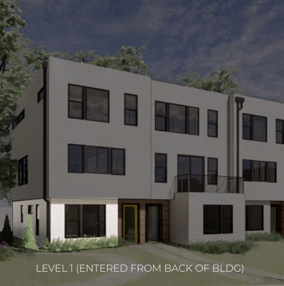
LEVEL 1 (ENTERED FROM BACK OF BLDG)